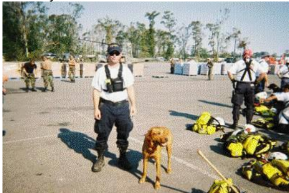
Shown here at Hurricane Katrina